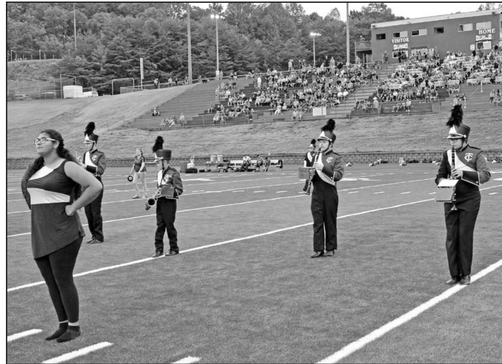
The Towns County High School marching band provides the soundtrack to each and every football season with their performances and pep music before and during the game.