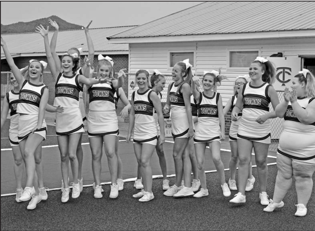
Every Friday night Towns County Cheer squad can be found on the sidelines doing their best to keep Frank McClure Stadium fired up for Indians football.

The Indians will hit the road this week as they head to Gilmer County to take on the Bobcats on Friday, Aug. 30, at 7:30 p.m.